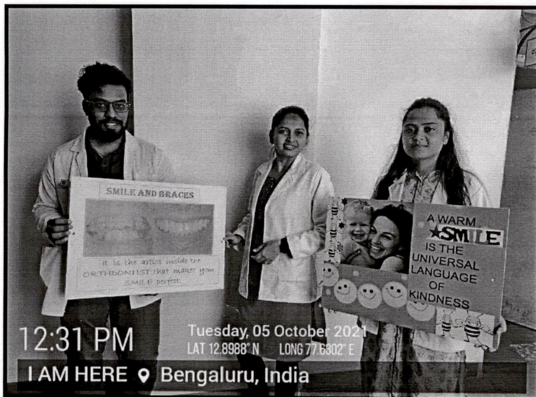
Poster presentation by Undergraduate students

Dean and Director The Oxford Dental College, Bommanahalli Hosur Road Bengaluru - 560 068