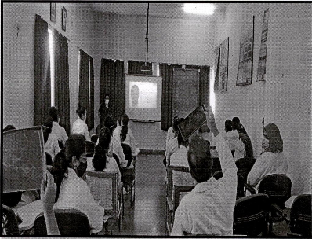
Discussion sessions on case presentation