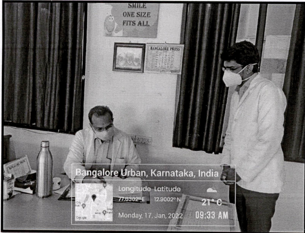
Daily interactive sessions with students individually

Dean and Director The Oxford Dental College, Bommanahalli Hosur Road Bangalore - 560 068